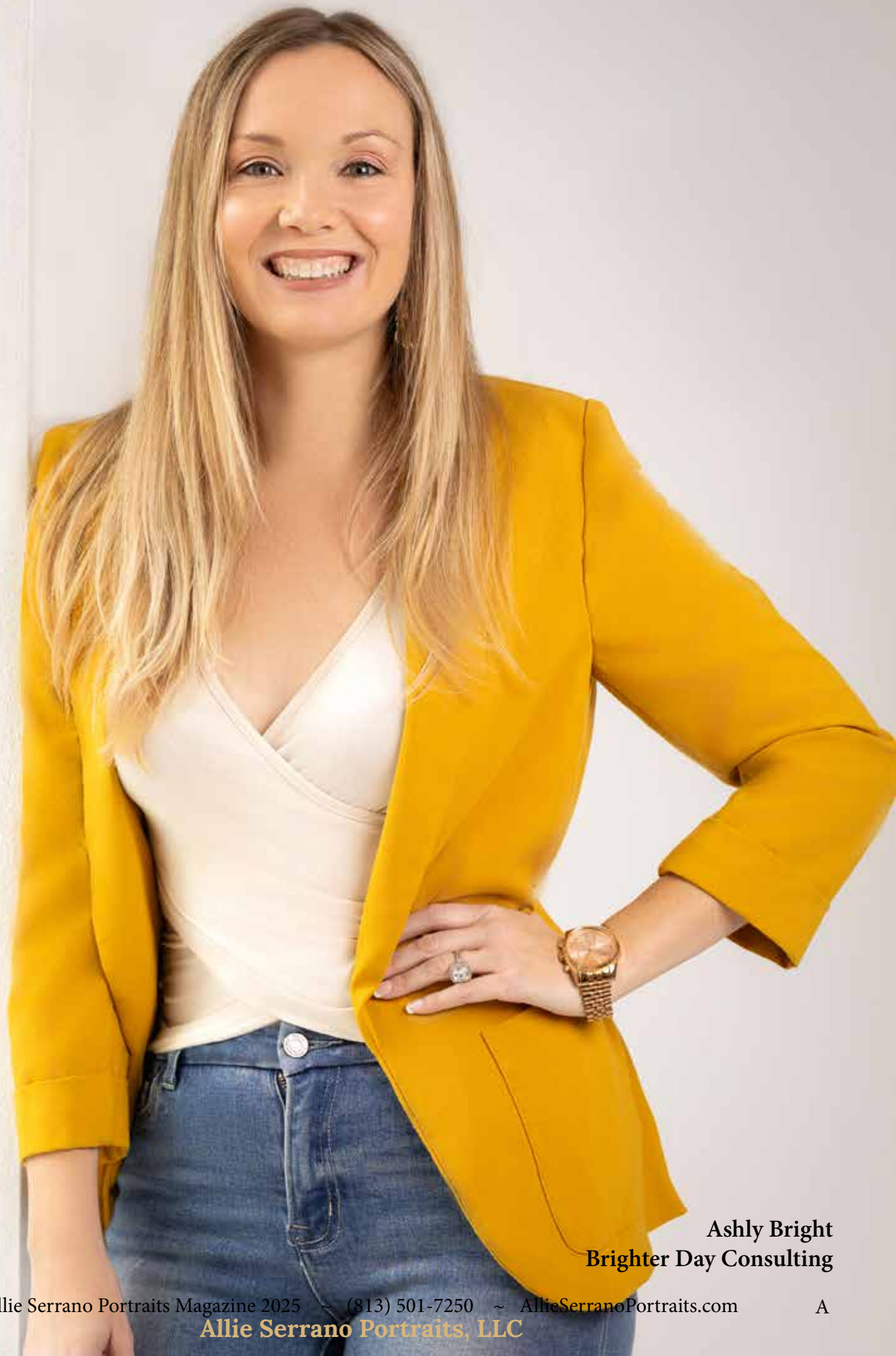
Ashly Bright Brighter Day Consulting