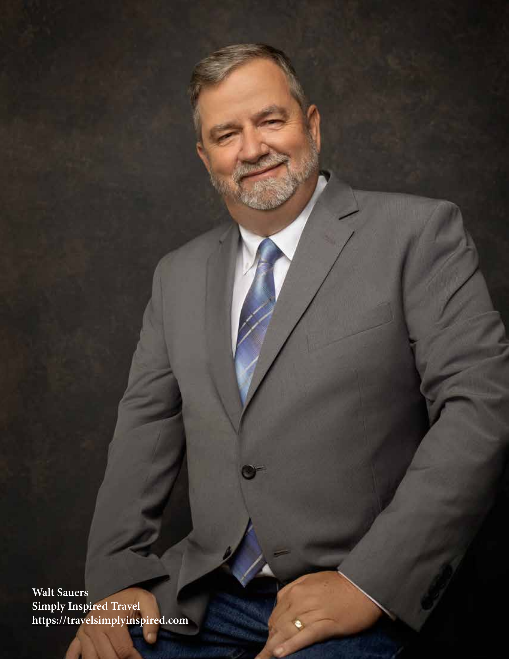
Walt Sauers Simply Inspired Travel https://travelsimplyinspired.com