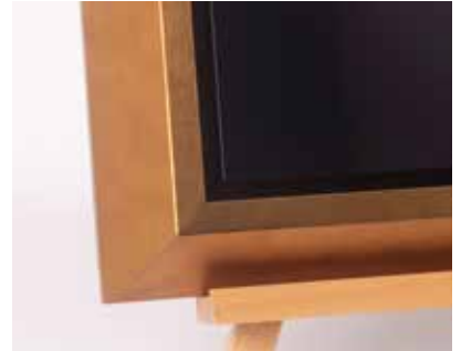
ACRYLIC METAL PRINT BLACK FRAMED